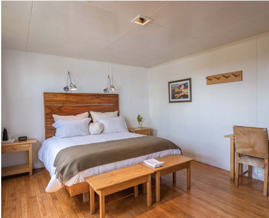
Villa María Lodge offers 3 en-suite double rooms and 3 single en-suite queen bedrooms.