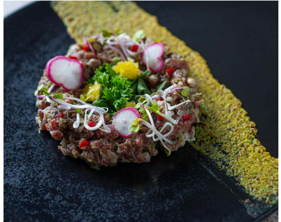
Guanaco Tartar - Each dish is prepared with an artisan's touch and influenced by the earthiness of the surrounding landscape.