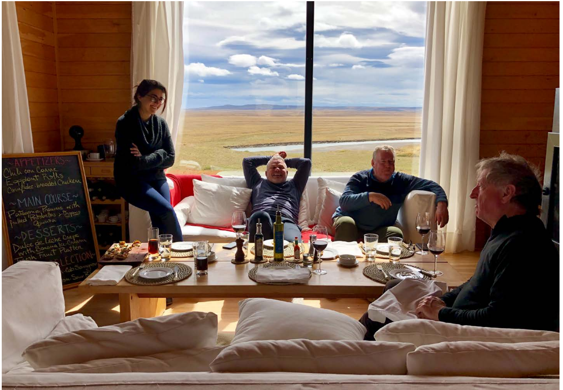
The river house offers gorgeous views of the wilds of Tierra del Fuego. Enjoy the stunning setting while having a delicious lunch and drinks with friends.