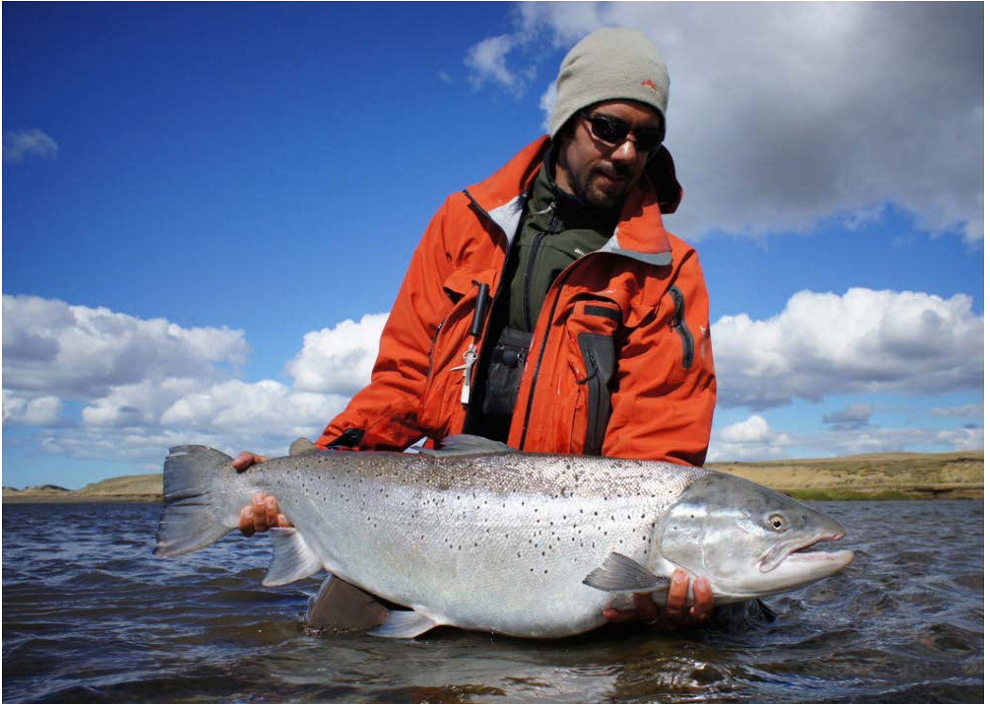
Villa María Lodge sits on the lower section of the Rio Grande, where powerful chrome sea trout enter the river system.