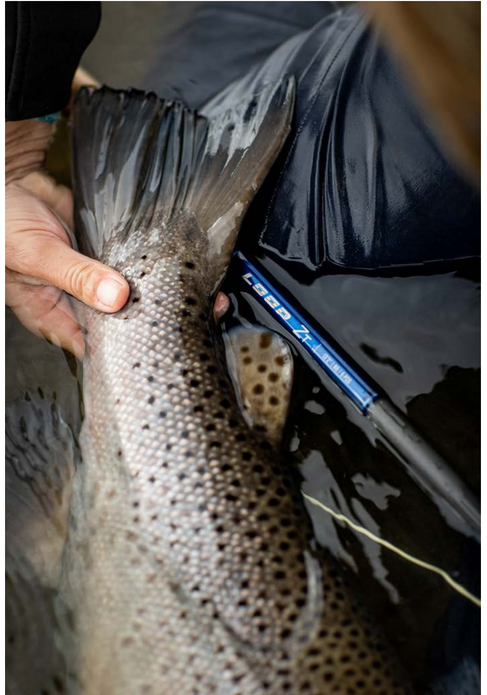
Target huge Sea-Run Trout fresh from the sea, averaging 8lbs and weighing up to 30lbs.