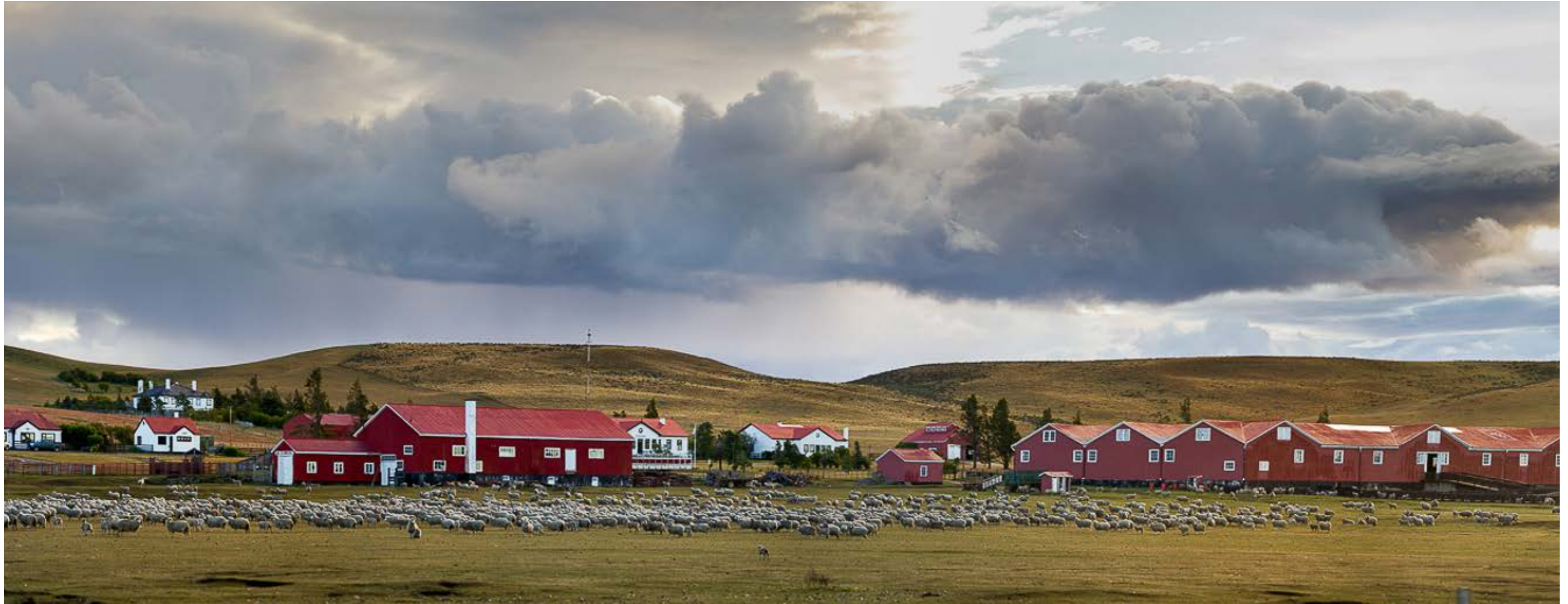
Villa María Lodge is located in the José Menéndez Estancia which was established in 1895