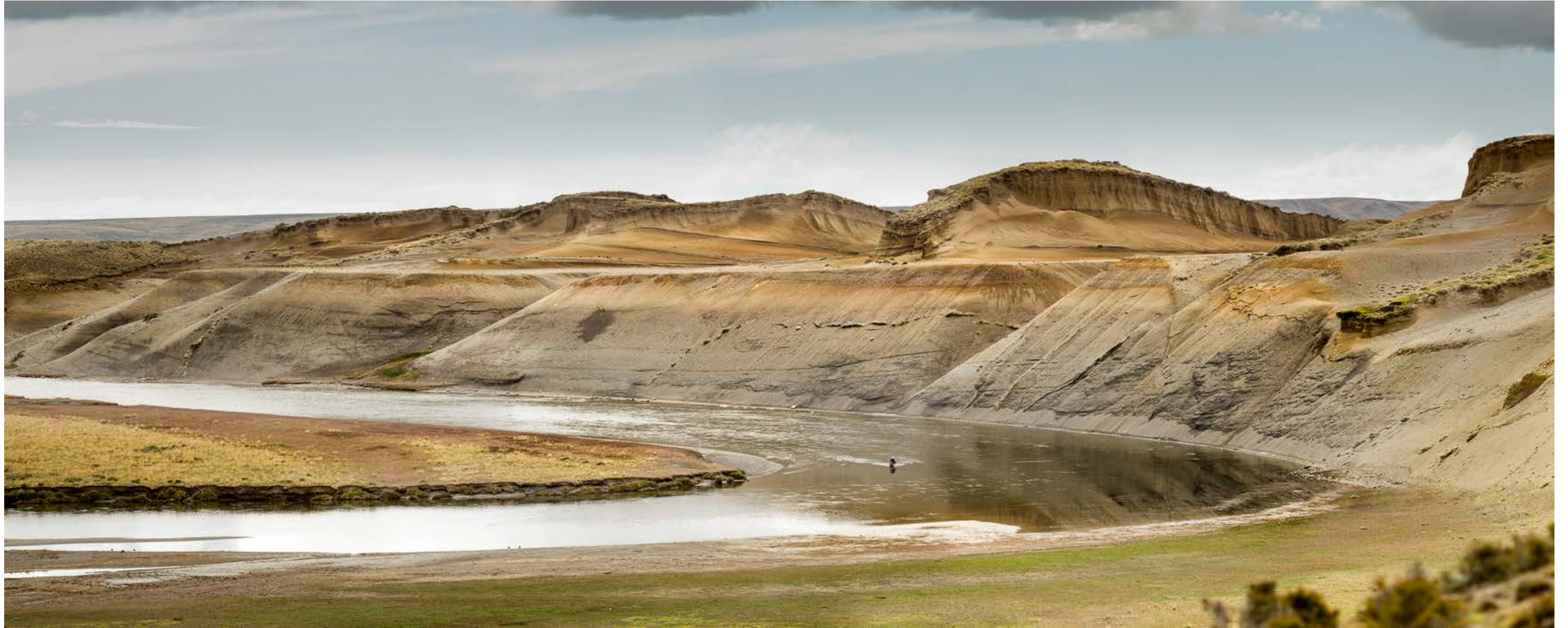
Villa María Lodge sits on the lower section of the Rio Grande, where powerful chrome sea trout enter the river system